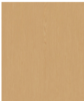
Ivory Infinite Oak