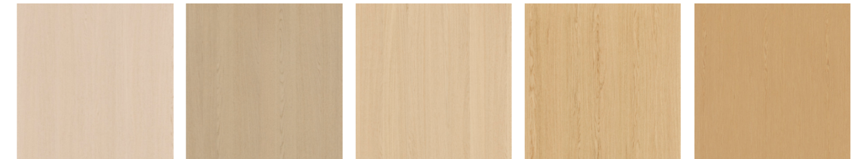
Bondi Oak Desert Oak Milk Oak Ivory Oak Ivory Infinite Oak